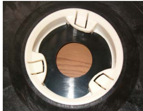
New style clutch plate***

New style brushes and pad holders will be required for this change.